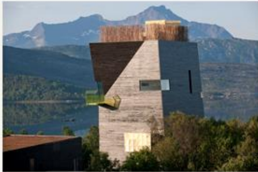
THE HAMSUN CENTRE