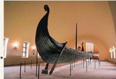
THE VIKING SHIP MUSEUM