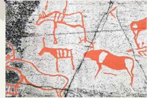
WORLD HERITAGE ROCK ART