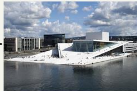
OSLO OPERA HOUSE